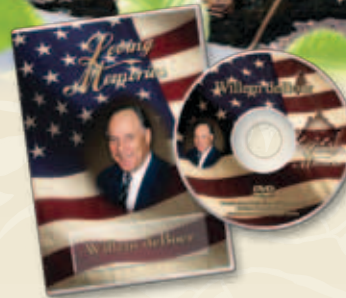
LifeStory Video Tribute

Additional charges may be incurred for bodies in excess of three hundred pounds, out of town transportation, biohazardous removals requiring special equipment for bodies in advanced stages of decomposition, extra personnel for difficult removal situations and insurance filing obstacles.