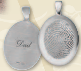
Thumbie® with Engraving