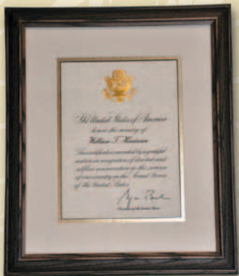
Presidential Memorial Certificate