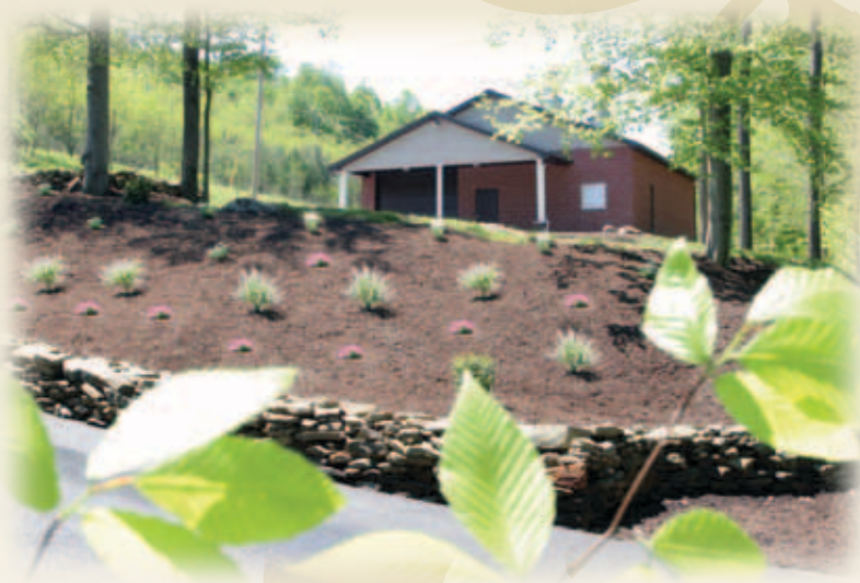
Cremation at our Private Facility