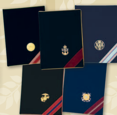
Register Books Made of Genuine Military Cloth