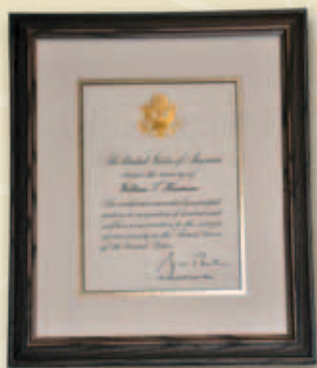
Presidential Memorial Certificate