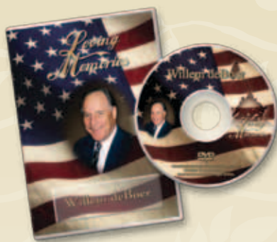
Patriotic Video Tribute