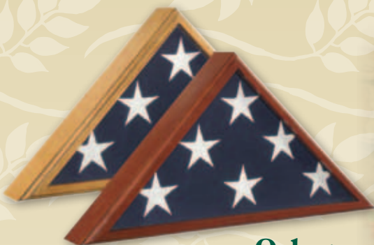
Oak or Cherry Flag Case