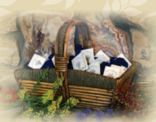
Wildflower SM Tributes