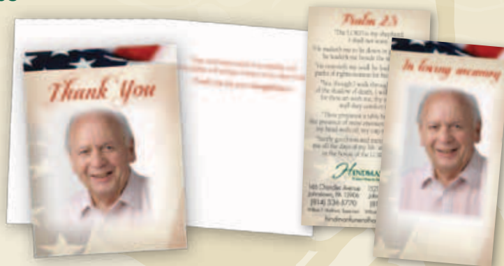
Custom Laminated Prayer Cards and Thank You Card