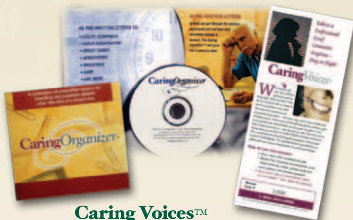
Caring Voices TM Grief Support System