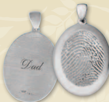
Thumbie ® with Engraving