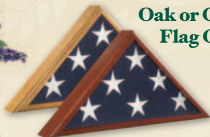
Oak or Cherry Flag Case