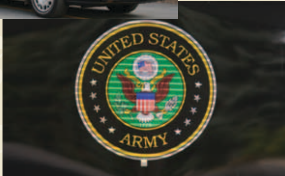
Funeral coach and cortege