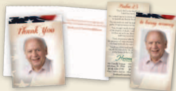
Custom Laminated Prayer Cards and Thank You Card