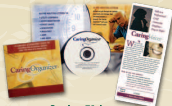
Caring Voices TM Grief Support System