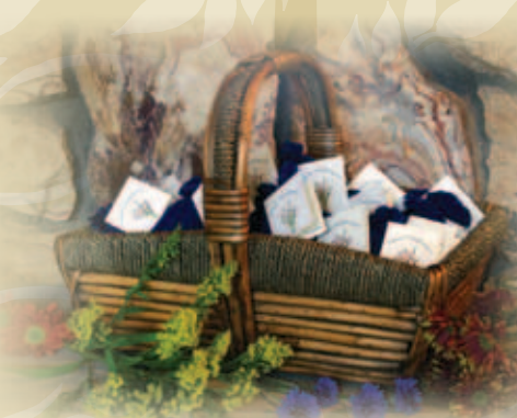
Wildflower SM Tributes