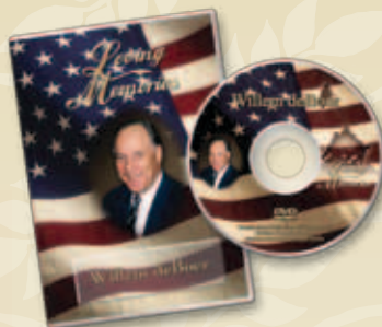
Patriotic Video Tribute