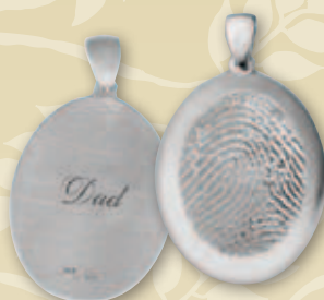
Thumbie® with Engraving