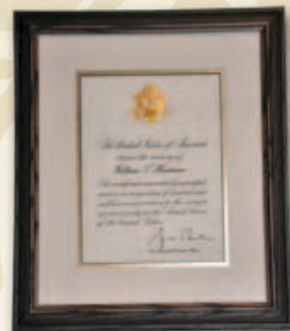
Presidential Memorial Certificate