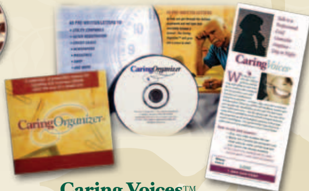
Caring Voices TM Grief Support System