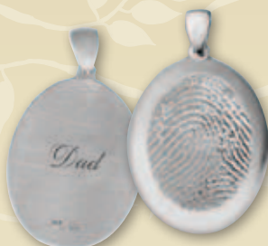
Thumbie® with Engraving