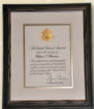
Presidential Memorial Certificate