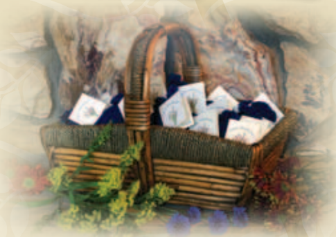
Wildflower SM Tributes