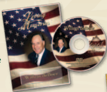
Patriotic Video Tribute