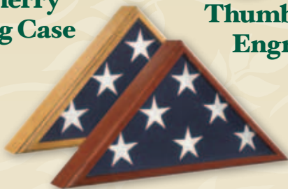
Oak or Cherry Flag Case