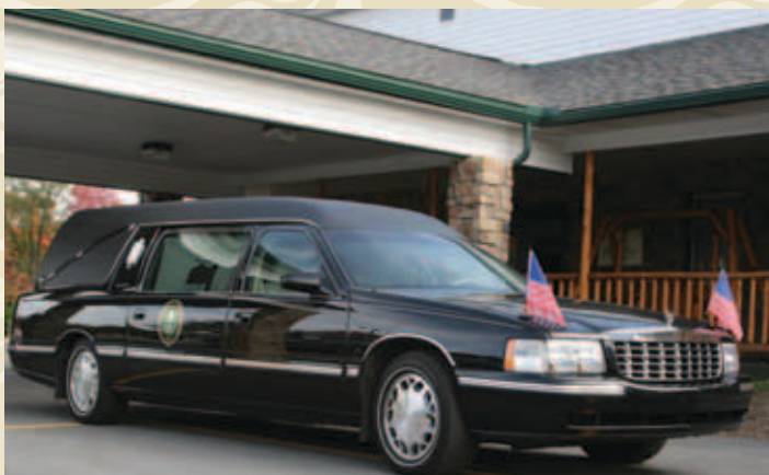
Funeral coach and cortege