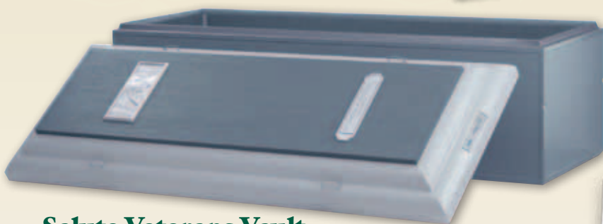
Salute Veterans Vault