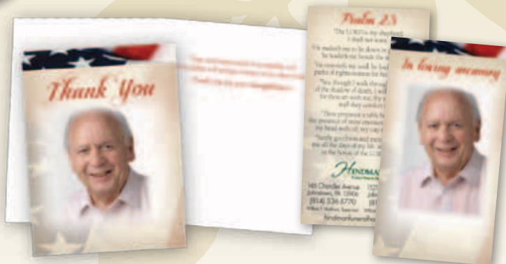
Custom Laminated Prayer Cards and Thank You Card