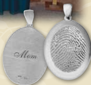
Thumbie ® with Engraving