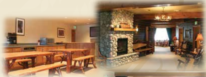
Use of Funeral Home Facilities