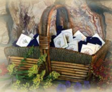
Wildflower SM Tributes