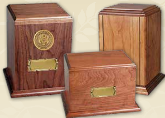
Choice of Urn