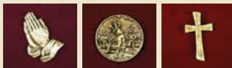
Choice of Over 50 Different Urn Appliqués