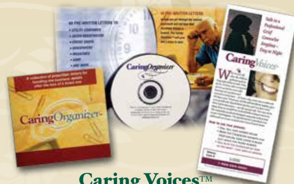
Caring Voices ™ Grief Support System