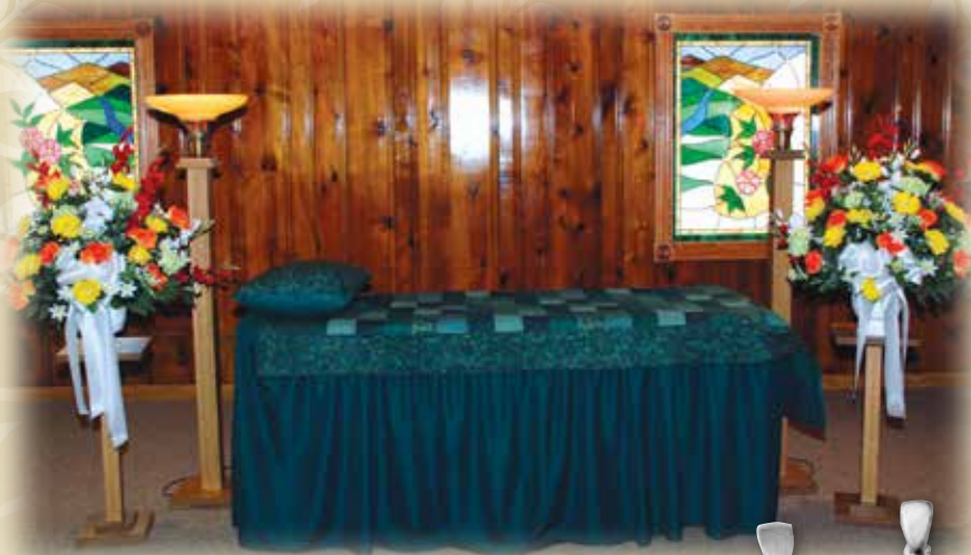
Quilt with flowers