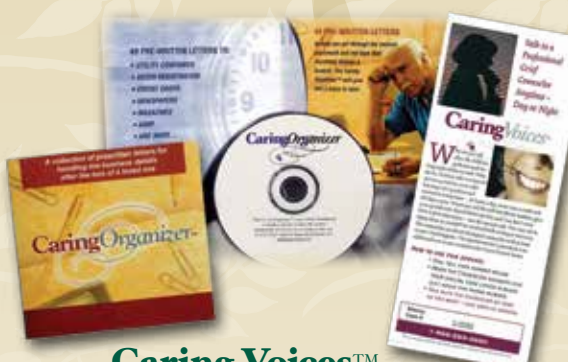
Caring Voices<sup>TM</sup> Grief Support System